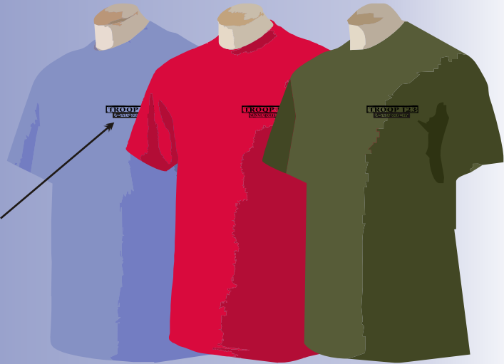
Crew info imprinted left chest

This is a 6.1 oz., 100% preshrunk cotton jersey knit t-shirt with seamless cover seam and stitched collar. Taped neck and shoulders with tubular knit construction. Double-needle stitched sleeve and bottom hem. Color: Carolina Blue, Red, Military Green